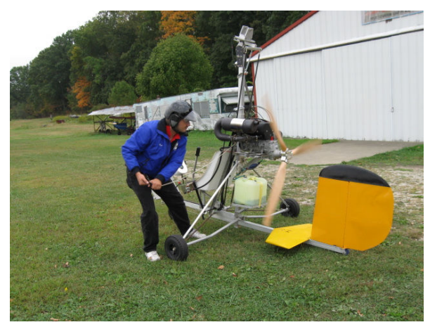
Doing Taxi Tests! (I have to start the engine first.)

September 19th was a nice day to spend at an airport. Since the members of the Buckeye Rotorheads PRA #19 were getting together to do some flying in the towed trainer, I decided to bring my bird up and run it up and down for some taxi trials.